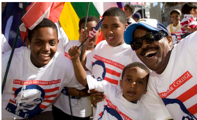
(Clockwise from top) Those responsible for helping create the District’s first Pilipino-American course, offered in fall 1978 at Evening College, Mesa campus, gather together ahead of the program’s launch. Over the past 50 years, the District has prided itself on its DEIA programs, including Disability Support Programs and Services. San Diego’s annual MLK Day Parade was launched from College of Continuing Education, and the District continues to participate in the event to this day.