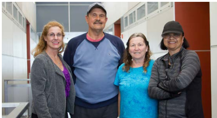
Students in College of Continuing Education's Acquired Brain Injury (ABI) program will benefit from a $1.8 million grant to help workers with disabilities enter jobs that pay at least the state's minimum wage.

Federal labor law has allowed employers to pay people with disabilities less than the minimum wage, with some being paid as low as 15 cents an hour. This has led to continued poverty for disabled people, who have a poverty rate of 18.4% compared to 11% for Cali-