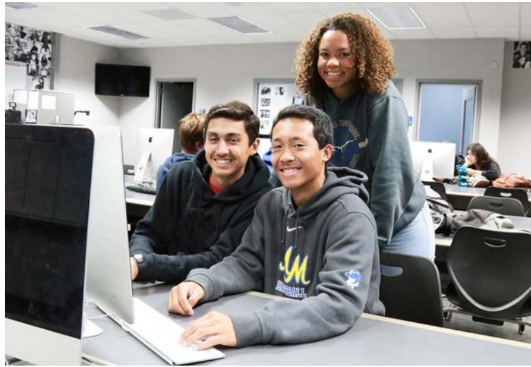
Dual enrollment, where students such as these at Mira Mesa High School, participate in a college-level class, earning credits for high school and college at the same time, was born out of a partnership between the joint boards of the SDCCD and the San Diego Unified School District.