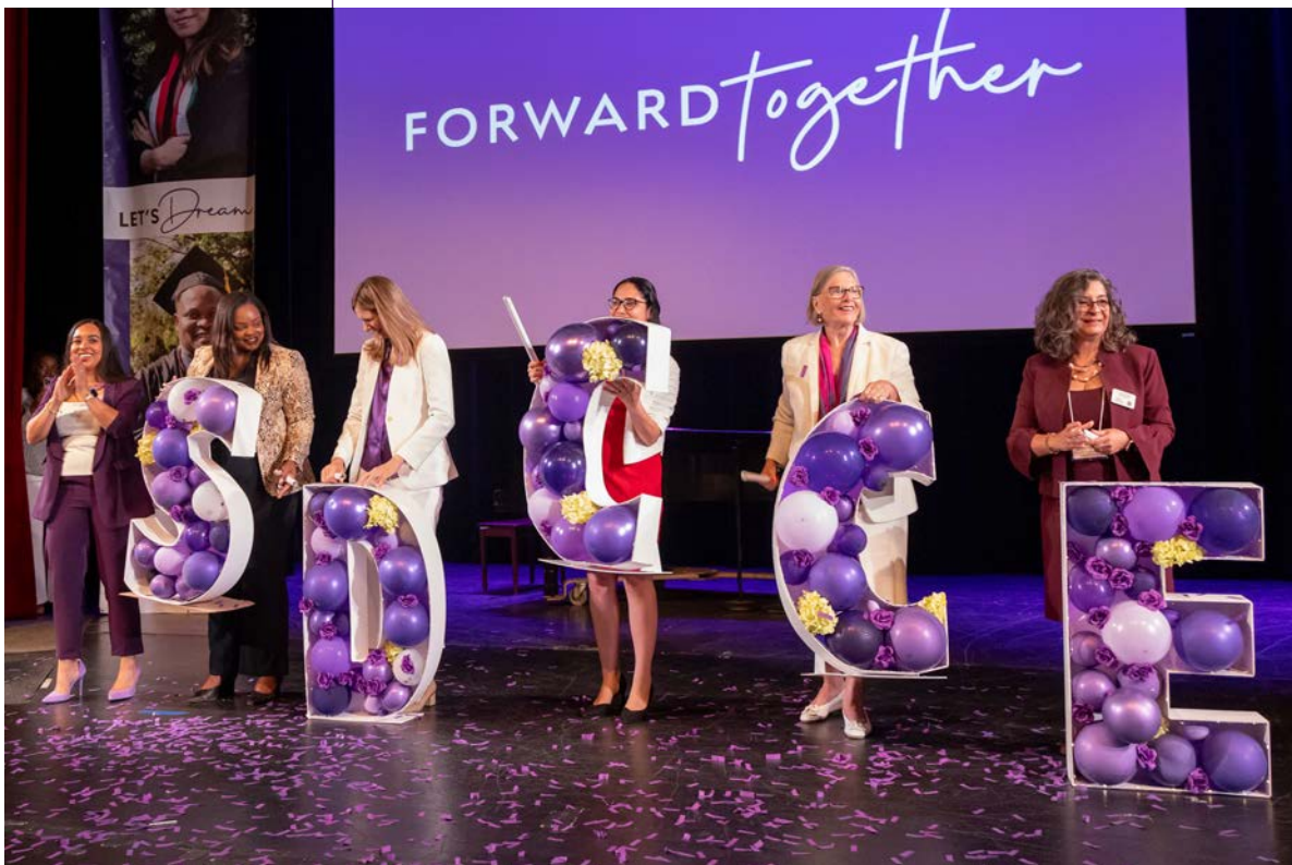
A refreshed College of Continuing Education wordmark logo and tagline (Forward Together), along with primary (purple) and secondary colors (yellow, red, and blue) — were revealed at fall Convocation.

Although new to SDCCE, GradComm has worked extensively with North Orange Continuing Education, Southwestern College, MiraCosta College, Cerritos College, and the California Community Colleges Chancellor’s Office, among others.