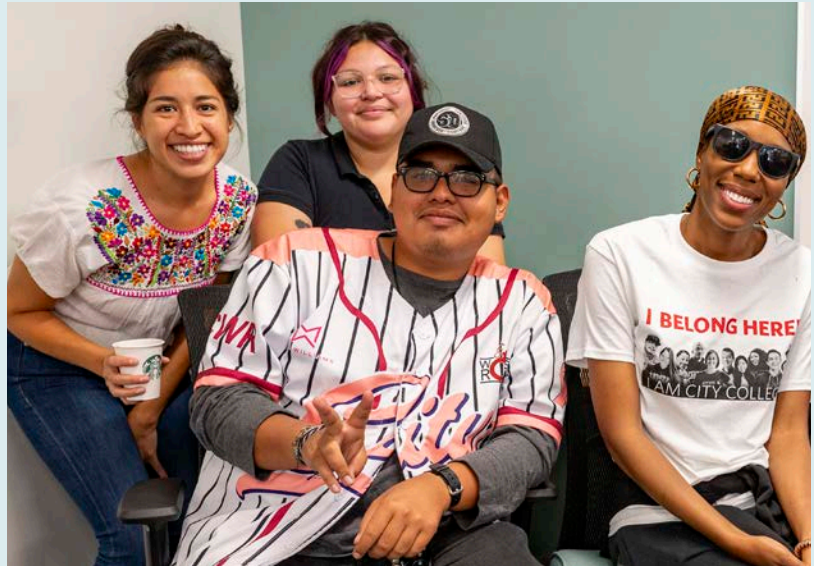
Students and Outreach staff gather at City College's Welcome Center during the first week of the fall semester.