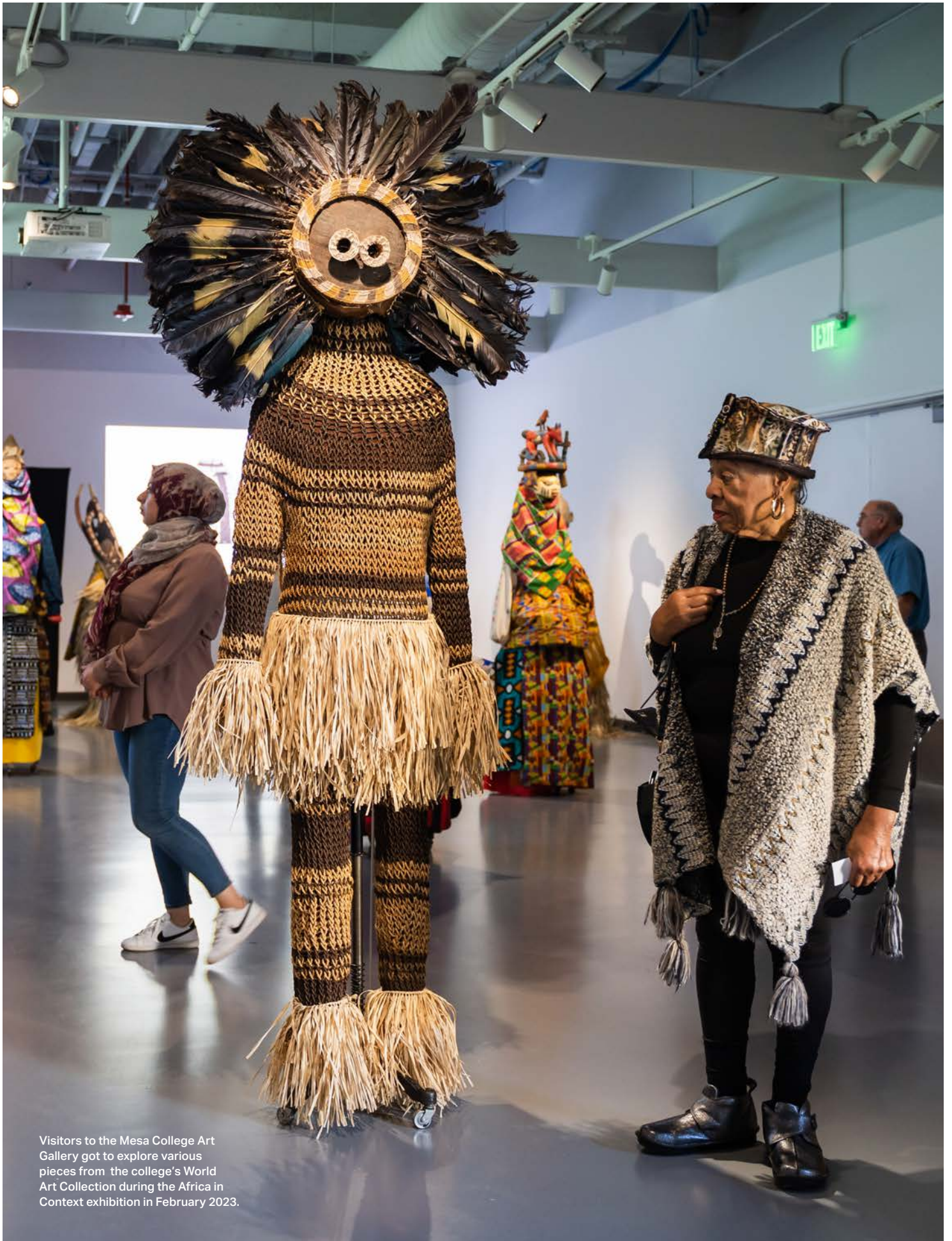
Visitors to the Mesa College Art Gallery got to explore various pieces from the college's World Art Collection during the Africa in Context exhibition in February 2023.