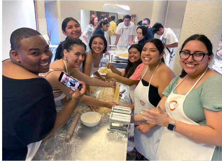
Students who took part in Mesa College's Florence study abroad program got to show off their pasta making skills during a cooking class.

In addition to the trip to Spain, Mesa College also offered a summer trip to Florence in which 37 students participated in programming focused on art history and fashion. The experience included visits to the Pitti Uomo Trade Show Fair, an internationally renowned menswear trade show, and a tour of the Polimoda Italian fashion school.