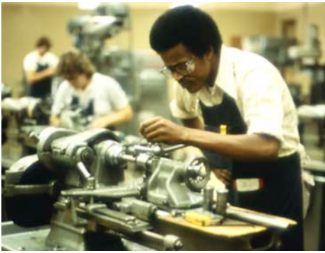
From aviation maintenance technology (left) to manufacturing engineering technology and welding, career education has been a major focus of SDCCD colleges for the past 50 years.