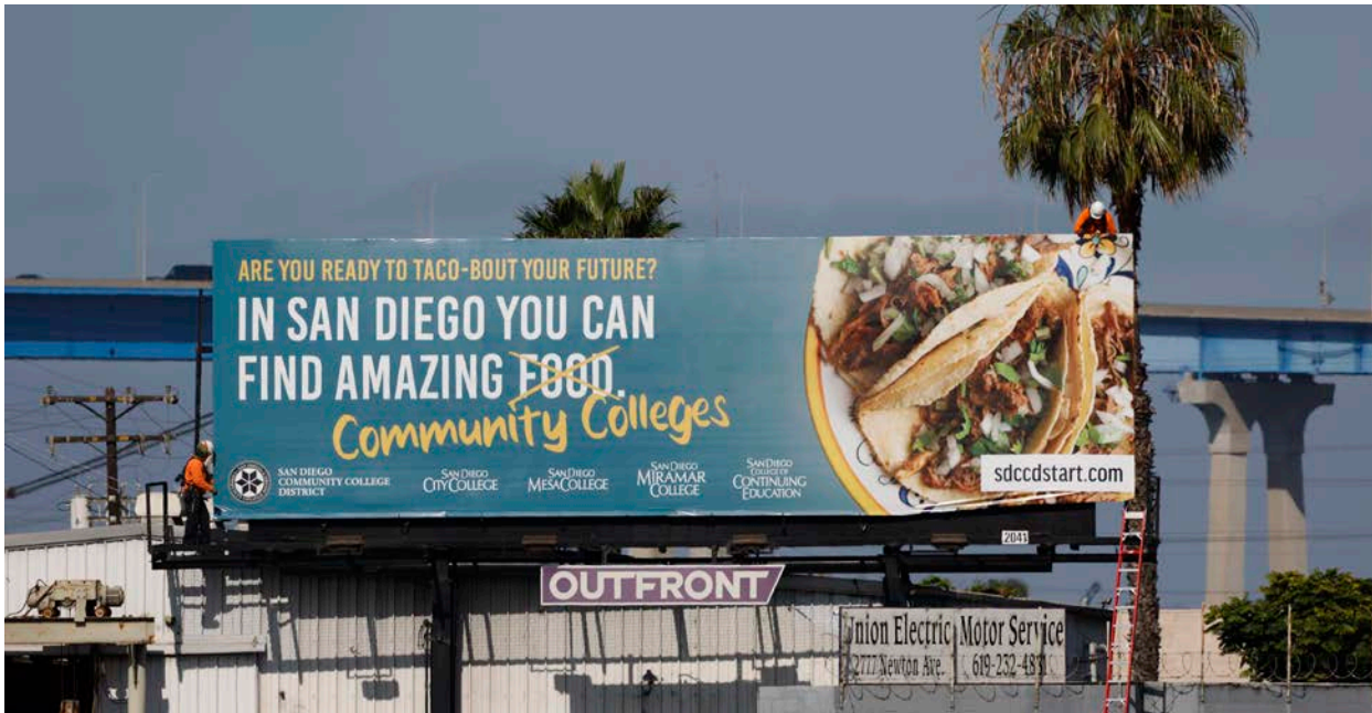
Workers install one of four billboards that went up around San Diego to promote enrollment opportunities at City, Mesa, Miramar, and Continuing Education colleges.

Seeking to get the attention of working adults, the San Diego Community College District has launched a new marketing campaign with a light-hearted play on beloved San Diego institutions such as the military, San Diego Zoo, Comic-Con, and tacos.