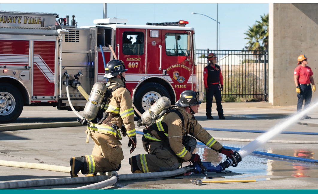
FIRE PROTECTION TECHNOLOGY PROGRAM

As San Diego's leading provider of job training including for first responders, nurses, emergency medical technicians, and for careers in biotechnology, cyber defense and sustainability — our community and our economy depend on San Diego's community colleges to provide cutting-edge facilities and programs that respond to changing industry needs.