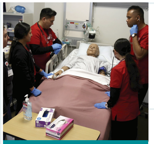
NURSING EDUCATION PROGRAM