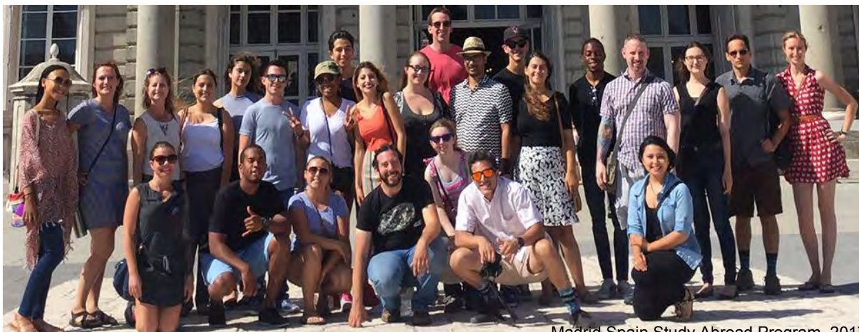
Madrid Spain Study Abroad Program, 2017