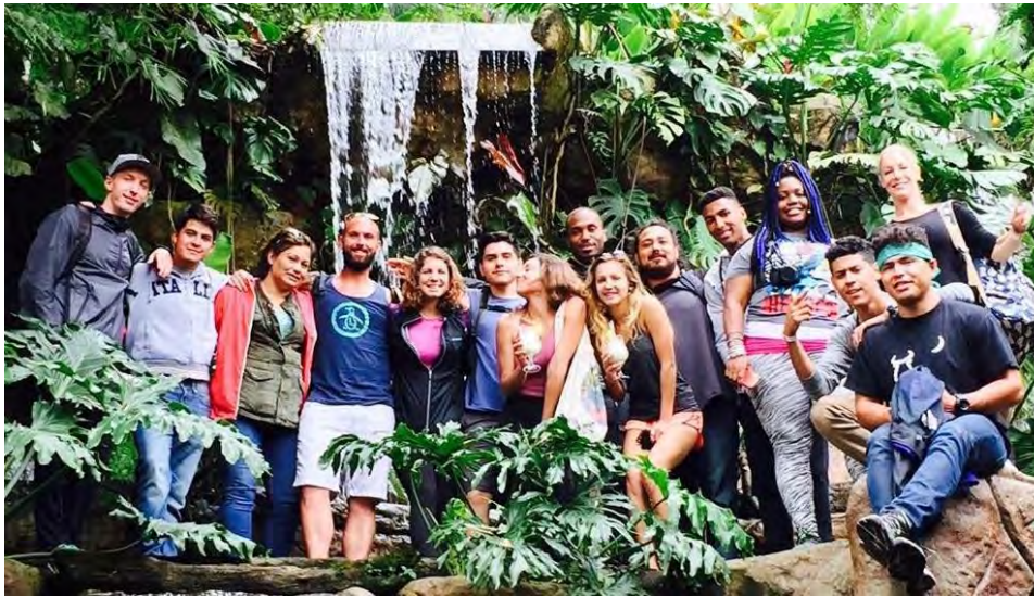
2017 Study Abroad Program, Costa Rica

Intersession 2018 was the first time SDCCD offered study abroad programs during the winter. For this inaugural offering, two programs were provided one in Costa Rica and one in Spain. Of the courses offered during intersession, Biology 180 in Costa Rica, had the highest enrollment at 21 students.