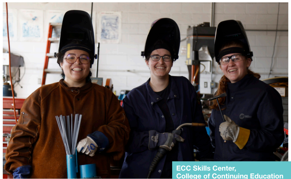
ECC Skills Center, College of Continuing Education