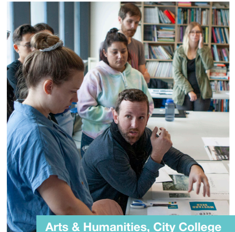
Arts & Humanities, City College