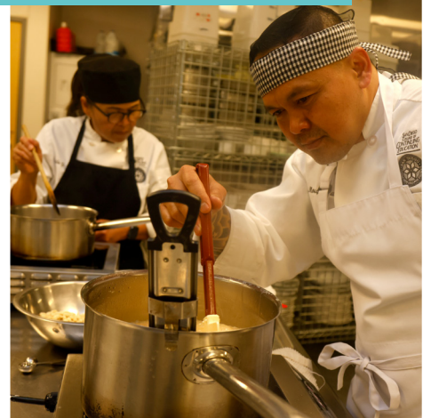
West City Campus, College of Continuing Education