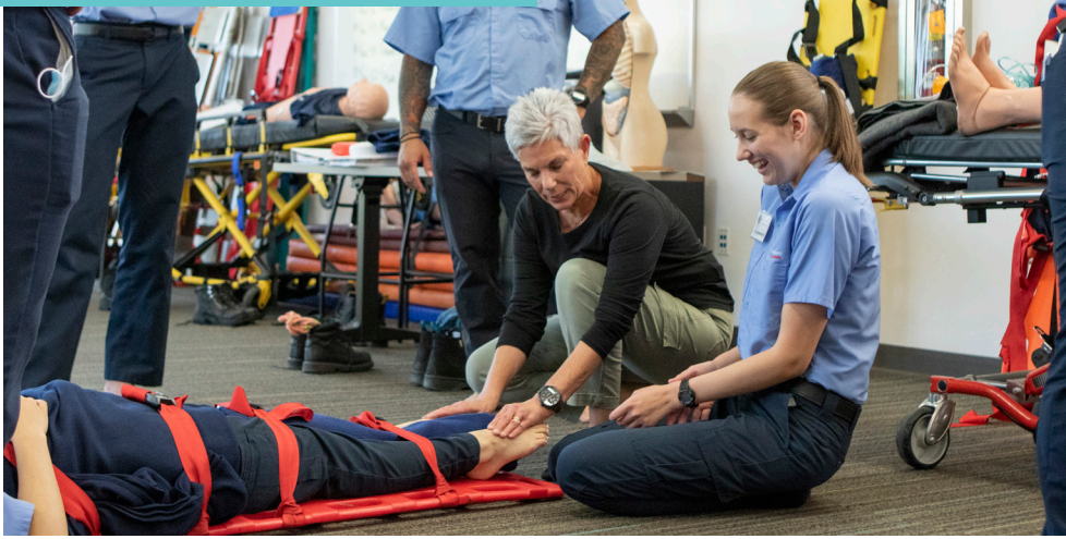
Fire Technology & EMT, Miramar College