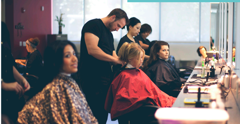
Career Technology Center, City College