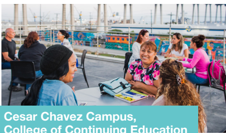
Cesar Chavez Campus, College of Continuing Education