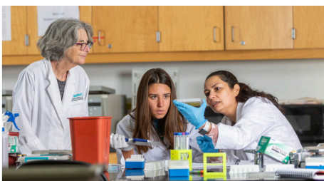
Science & Technology, Miramar College