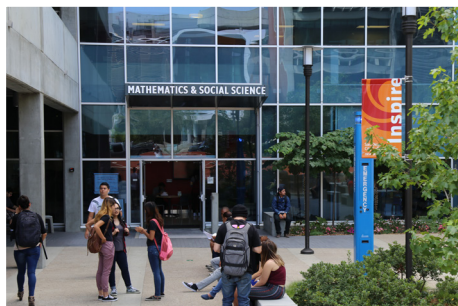
Mathematics & Social Science, City College

A full listing of awards is available online at props-n.sdccd.edu/about/pages/awards.aspx .