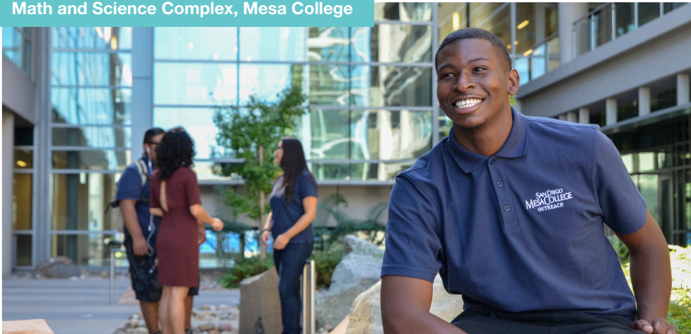
Math and Science Complex, Mesa College