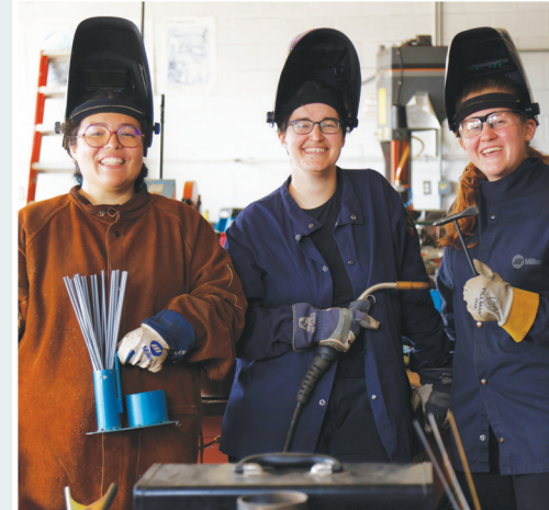
ECC SKILLS CENTER