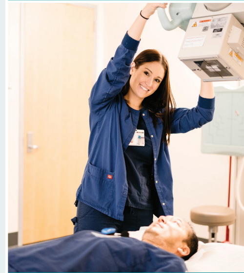
RADIOLOGIC TECHNOLOGY PROGRAM