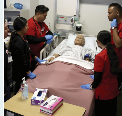
NURSING EDUCATION PROGRAM