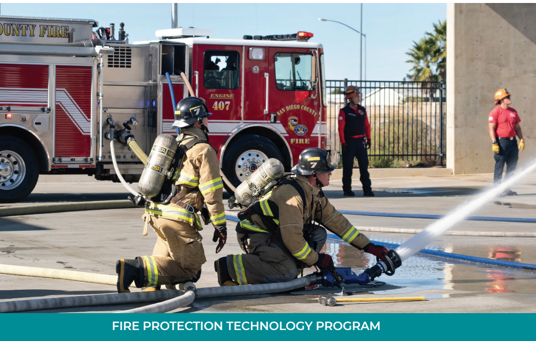
FIRE PROTECTION TECHNOLOGY PROGRAM

As San Diego's leading provider of job training — including for first responders, nurses, emergency medical technicians, and for careers in biotechnology, cyber defense and sustainability — our community and our economy depend on San Diego's community colleges to provide cutting-edge facilities and programs that respond to changing industry needs.