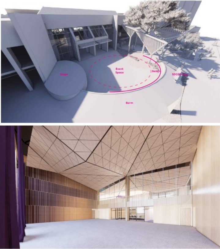
Floor Plan | Schematic Design

Initial site assessments are underway with the Architect and engineering team. The AE team is reviewing available as-built documents and evaluating the existing site and space conditions, assess capacity, and determine feasibility for improvements. Conceptual floor plans were developed and presented to leadership and users to ensure program needs are met. Findings from these assessments will inform and refine the project programming.