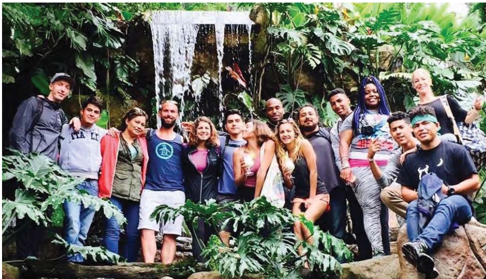
2017 Study Abroad Program, Costa Rica

Intersession 2018 was the first time SDCCD offered study abroad programs during the winter. For this inaugural offering, two programs were provided one in Costa Rica and one in Spain. Of the courses offered during intersession, Biology 180 in Costa Rica, had the highest enrollment at 21 students.