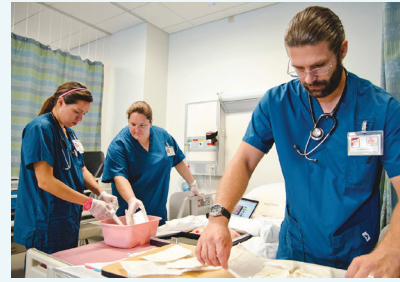
Nursing Program San Diego City College