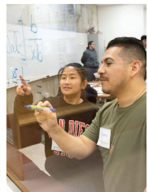
Mathletics San Diego Mesa College

Together, these dynamic, student-centered, industry-informed programs are working to meet the call for a diverse and talented pipeline for advanced STEM skills.