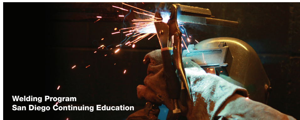
Welding Program San Diego Continuing Education

SDCCD's Employee Training Institute was created to provide affordable workforce training, organizational consulting, and fiscal and project management services to different sectors such as biotechnology, health services, manufacturing, hospitality, and government agencies. As the District's leading customized training provider, the Institute helps find the talent gaps, understand where you are today, but more importantly, where your company needs to be tomorrow to remain competitive.