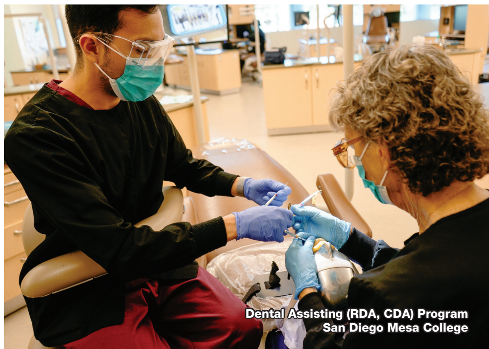
Dental Assisting (RDA, CDA) Program San Diego Mesa College