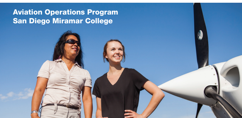
Aviation Operations Program San Diego Miramar College

The SDCCD Corporate Council is kept abreast of the variety of programs and courses offered at San Diego City, Mesa, and Miramar Colleges, and Continuing Education that are aligned with market demand. The following is a partial list of Career Education program areas categorized by industry sector and institution.