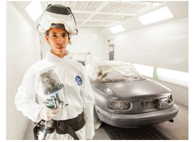
Auto Body & Paint Technician Program San Diego Continuing Education