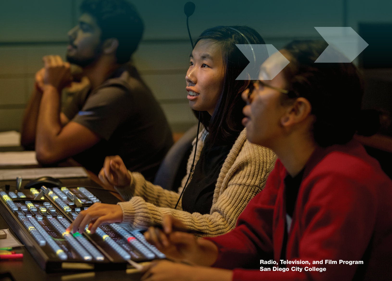
Radio, Television, and Film Program San Diego City College