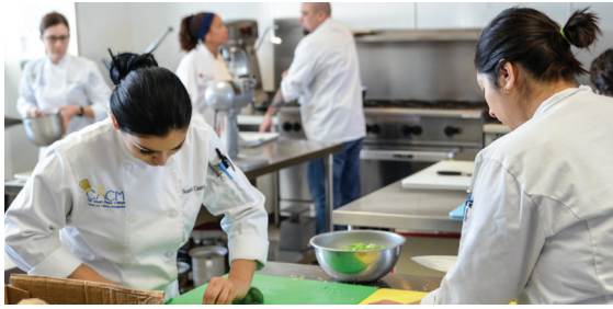
Culinary Arts/Culinary Management in Hospitality Program San Diego Mesa College