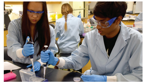
Biotechnology Program San Diego Miramar College

K-14 Outreach Program: Since 2004, in partnership with the Amgen Foundation and the San Diego Workforce Partnership, this program has reached every school district in San Diego County. The ABE program is part of an international effort of the Amgen Foundation to improve science literacy. To date, over 200 teachers and college faculty have been trained. The SCBC maintains a lending library of equipment and provides free supplies to support over eighty K-14 teachers and professors annually.