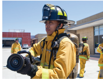
Fire Technology Program San Diego Miramar College