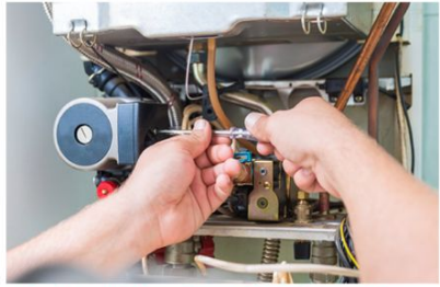
Air Conditioning, Refrigeration, Alcohol & Other Drug Studies and Environmental Control Technology