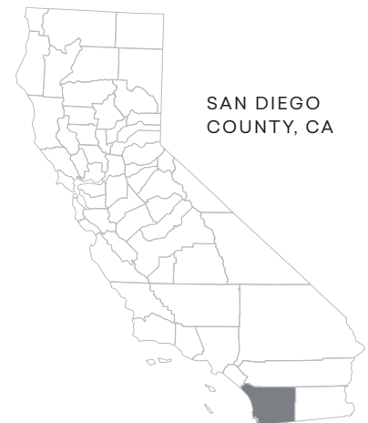
SAN DIEGO COUNTY, CA

Career and Technical Education 1 (CTE) at San Diego Community College District 2 (SDCCD) creates a significant positive impact on the business community and generates a return on investment to its major stakeholder groups—students, taxpayers, and society. Using a two-pronged approach that involves an economic impact analysis and an investment analysis, this study calculates the benefits received by each of these groups. Results of the analysis reflect fiscal year (FY) 2019-20.