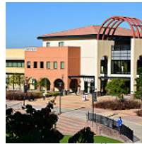
Miramar College 10440 Black Mountain Road San Diego, CA 92126-2999